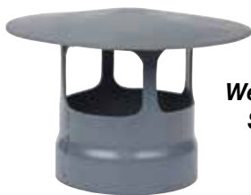
Weather Cap Style “A”