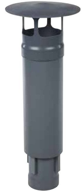
Style “A” shown with Style “B” Stack

This equipment is warranted to be free from defects in material and workmanship for two years from date of original shipment. For the complete warranty agreement, see I, O & M on www.plastecvent.net .