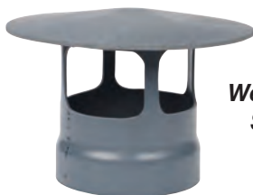
Weather Cap Style “A”