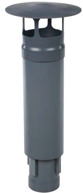
Style “A” shown with Style “B” Stack

This equipment is warranted to be free from defects in material and workmanship for two years from date of original shipment. For the complete warranty agreement, see I, O & M on www.plastecvent.net .